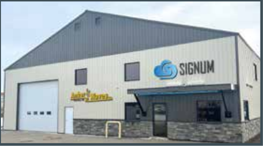
"We can always count on Stark Development to be there when we start new business projects. They are easy to work with and know how to make things happen!"