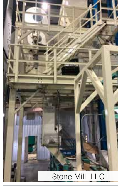
Stone Mill, LLC