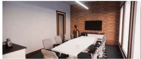
STARK DEVELOPMENT OFFICE FIT-UP RENDERING - CONFERENCE ROOM LOOKING NORTH