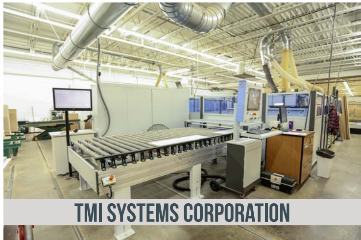
TMI SYSTEMS CORPORATION