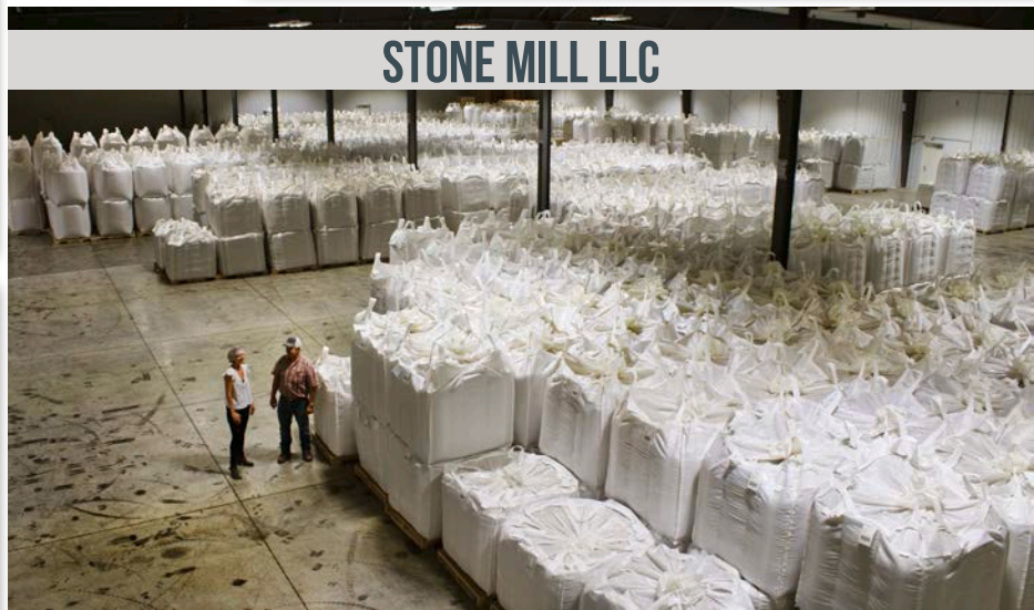
STONE MILL LLC