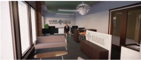
STARK DEVELOPMENT OFFICE FIT-UP RENDERING - OFFICE LOOKING WEST