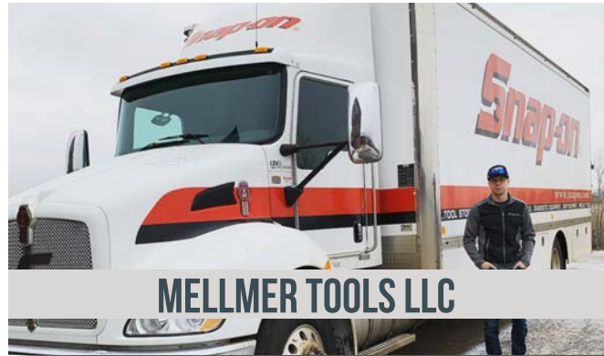
MELLMER TOOLS LLC