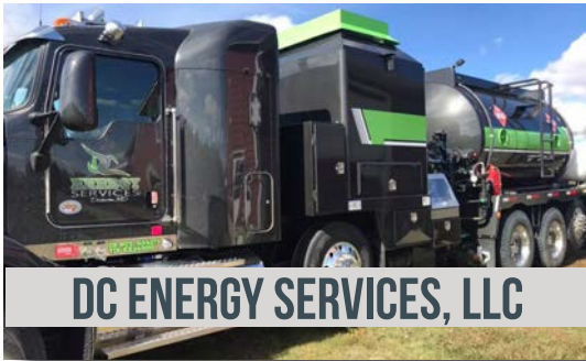
DC ENERGY SERVICES, LLC