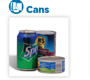
Aluminum and Steel Cans