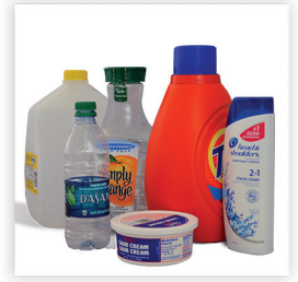
Kitchen, Laundry, Bath: Bottles and Containers