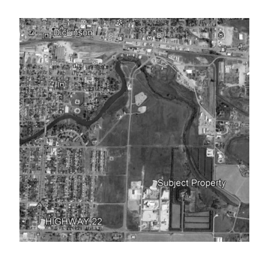
Located in South east Corner of Dickinson, with easy access to Highway 22