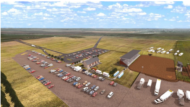
New Stark County Fairgrounds