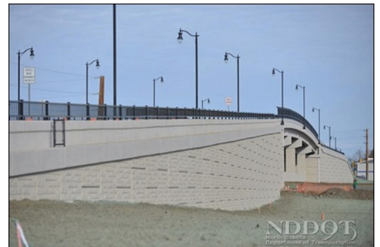
New State Avenue Bridge