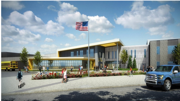
Dickinson Public Schools New Middle School