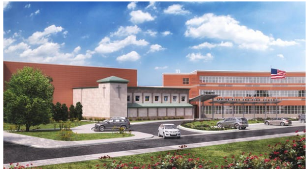
Trinity Junior High & High School Addition & Renovation