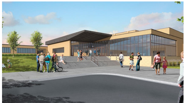
South Heart School Addition & Renovation