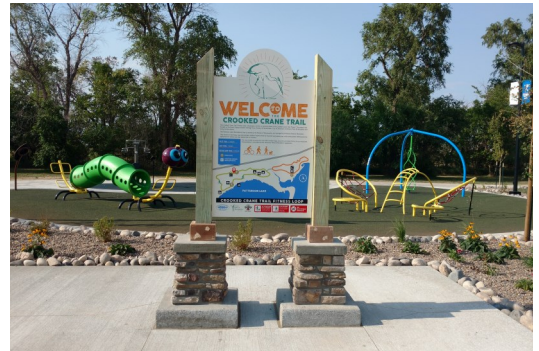
Crooked Crane Trail