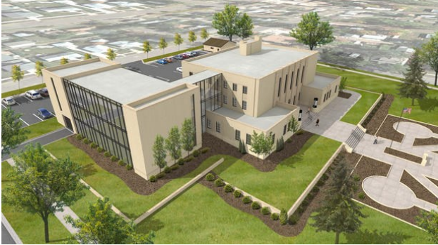
Stark County Courthouse Expansion