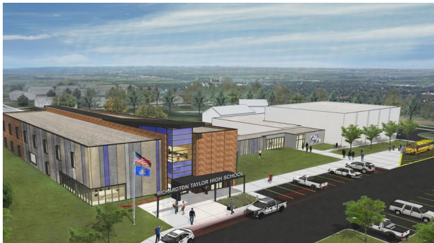
Richardton - Taylor High School Addition & Renovation